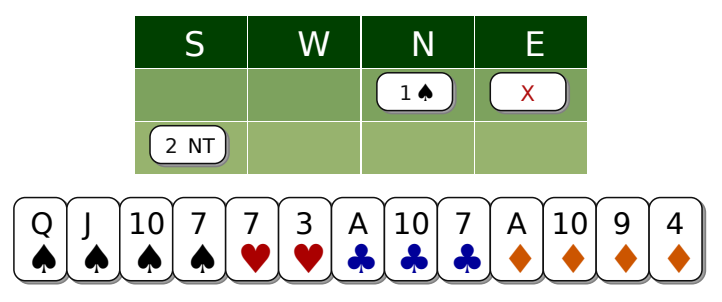
Exercise E4805 2 NT Truscott Showing a 4 cards support and about 11 HCP.

Reminder ! With the same number of points, but only 3 trump cards, redouble in order to look for the best contract.