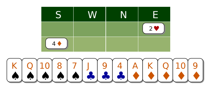
Problem E1278 4 diamondsIt's up to your Partner to choose between spades and hearts.