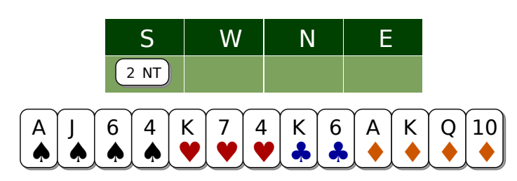
Problem E1811 With 20-21HCP and a regular hand, opening with 2NT is a priority