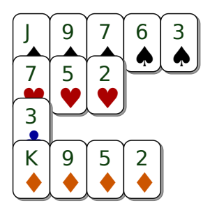
Quiz 1 ,Q11530,3,Problème Q11530 3 \clubsuit With this hand, don't lead a \spadesuit , (as you would if it was NT) give preference to your singleton \clubsuit