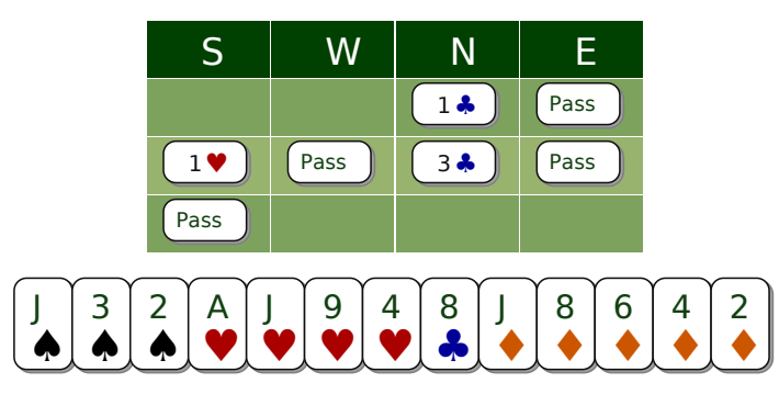
Problem E9128 Pass ... no chance for game