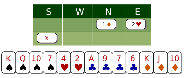
Problem E1458 : Responder who bids a negative double has at least 4 ♠ cards (after a ♥ bid)

Opener who has a fit, gives priority to supporting Responder's major.