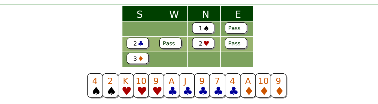
Problem E1591 3 • is the forcing fourth suit to find the best contract to play: NT or a suit?

Problem E1355 2 - here is a game-forcing fourth suit which allows the responder to show his powerful hand and a possibility of slam.