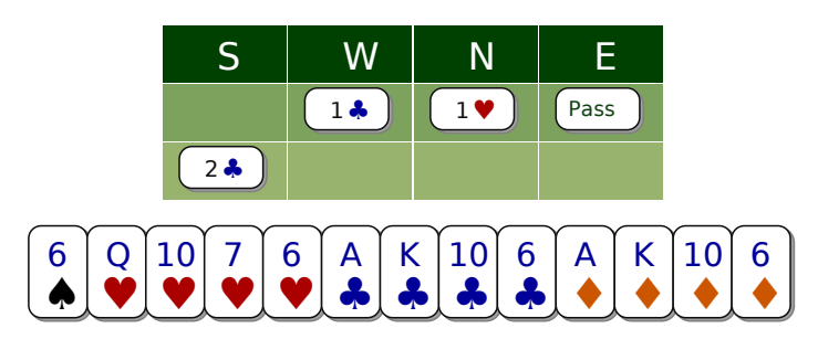
Problem 9917 2T non-jump cue-bid : Departure point for the start of Slam bidding.