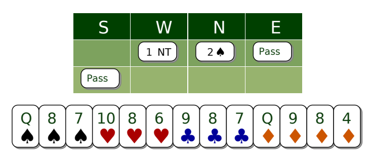
Exercise 9398 An horrible balanced hand... pass !