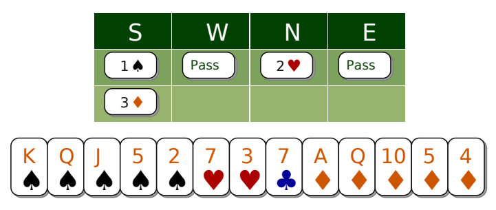
Problem E40023 3 • You always show a second 5-card suit, even at the 3-level.

There's no need to jump, since the partnership is already forced to game.