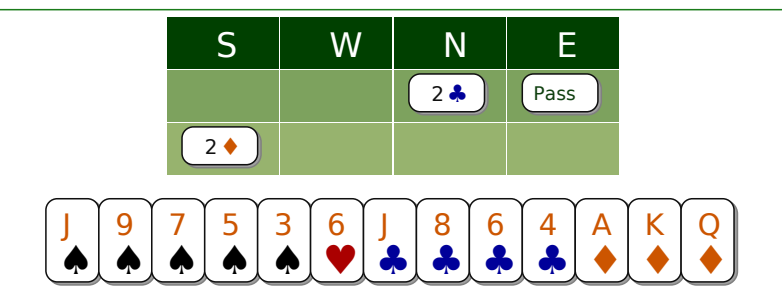
Problem 4528 é 🔶 The spades aren't strong enought

Find us on iBridge.co to improve your bridge performance. By playing practice boards, accessing lessons, tips and review sheets targeted just for you.