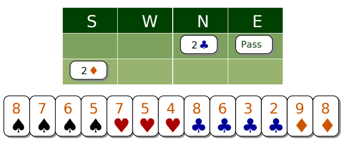
Problem E4523 2 You have to bid even with 0HCP!

-With a "nice" major and a minimum of 5 cards or a "nice minor with 6 cards and at least 8-9HCP - bid your suit.