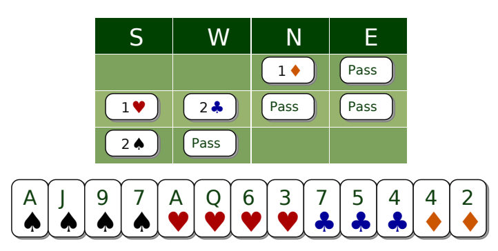
Problem E5817 2 A It's possible that the Opener only has 4 A ...